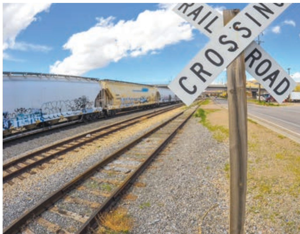
The west side has eight registered main grade crossings. With dozens of smaller crossings, facing train traffic can be a frustrating, regular occurrence on the west side.