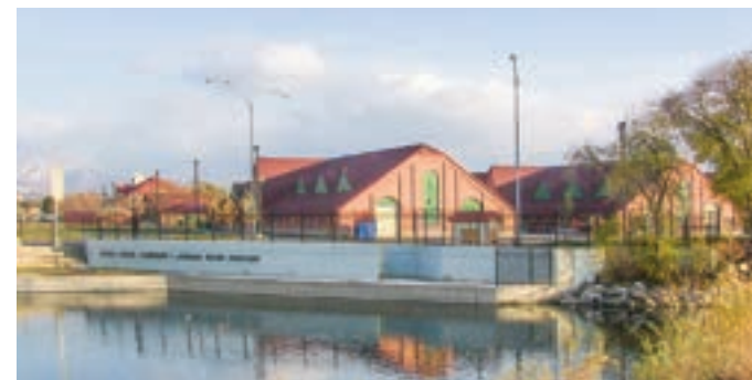
The historic barns at the State Fairpark were recently renovated, but they still have a timeless look stemming from traditional agricultural use.