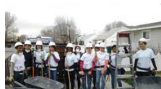
Youth Pre-Employment Programs