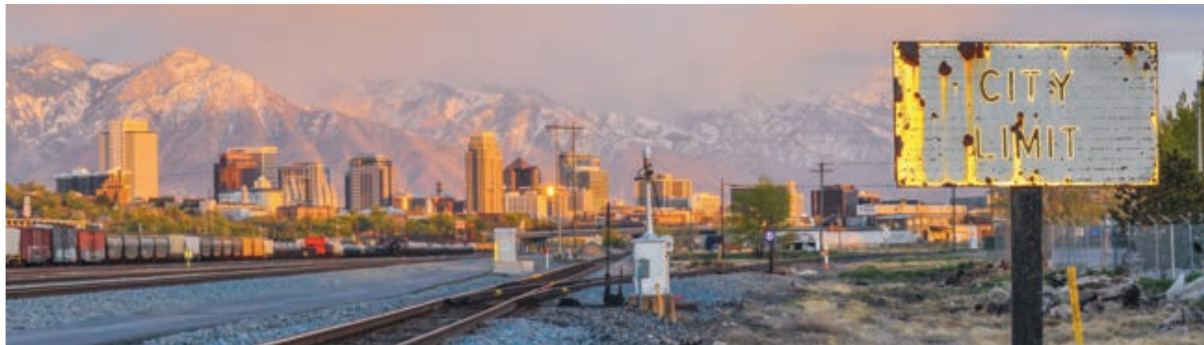
Union Pacific Railroad (UP) claims 1,248 miles of track in Utah. Trains run goods through our backyards, day and night.