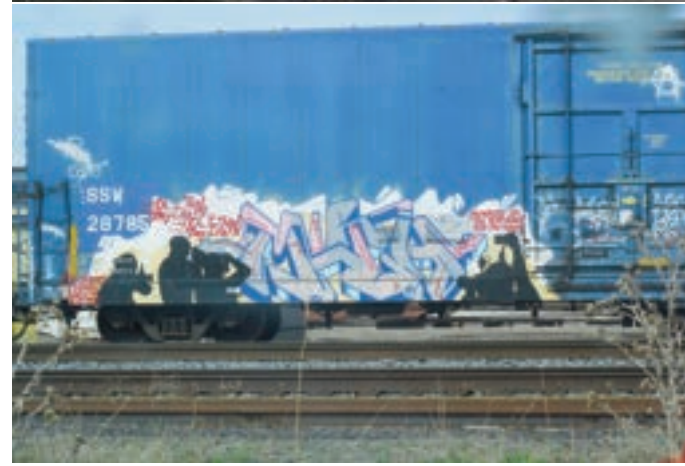
Using rail cars as their canvases, graffiti artists express their views with society. The messages behind the art can be political, reacting to shifts in culture, laws, or policies.