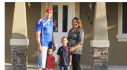
Home Ownership Services