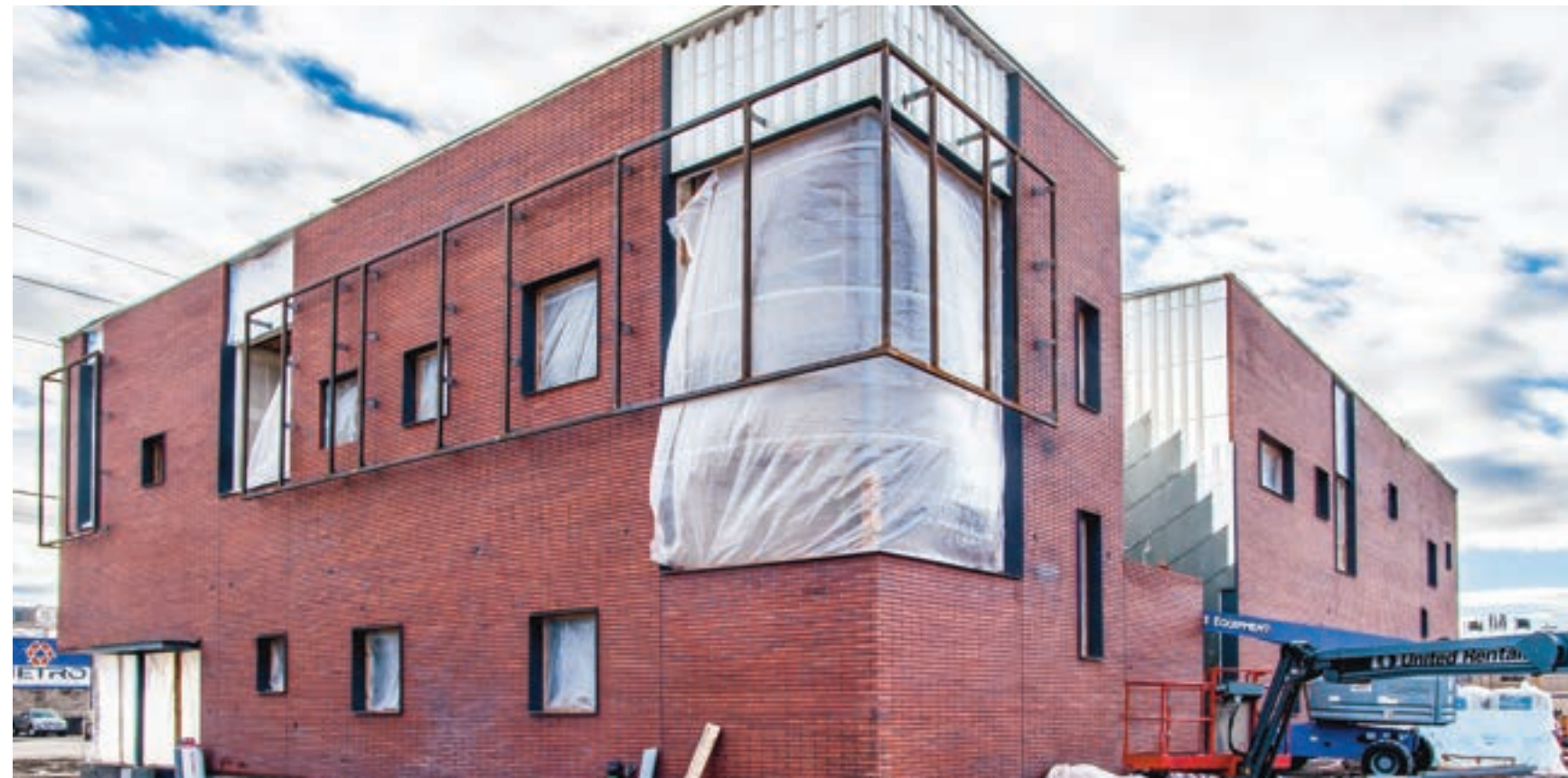
VOA raised approximately $6 m for the construction of a new Youth Resource Center at 888 S. 400 West. When the center opens sometime this spring, it will serve homeless youth, aged 22 and younger, 24 hrs a day, 7 days a week.