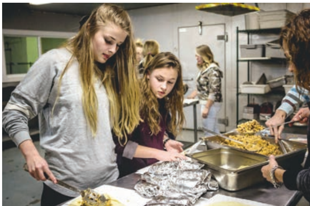
Volunteers prepare burritos at the Rico Brand warehouse to feed hungry and homeless people around Salt Lake City.