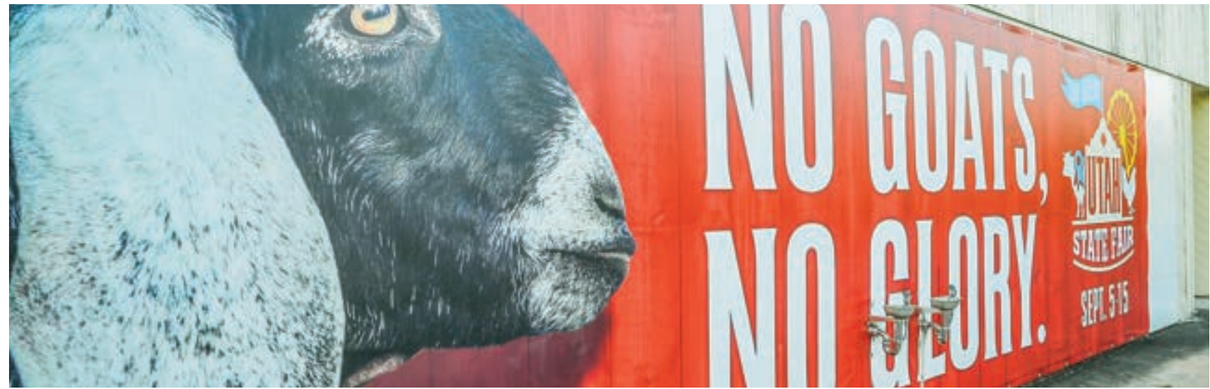
This image was part of the State Fairpark's ad campaign aimed at boosting attendance at the 2014 State Fair.