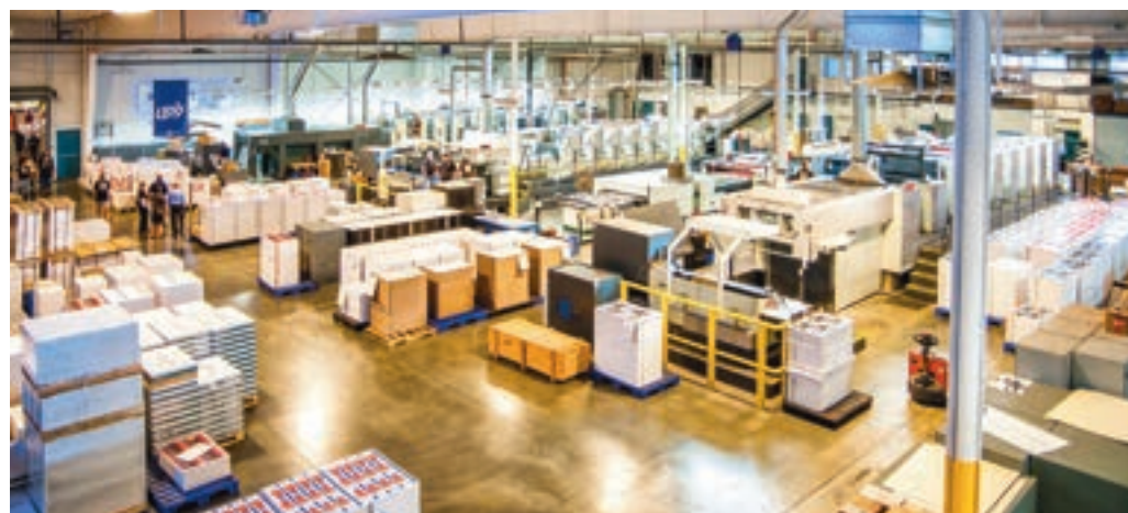
Utah PaperBox, a 101-year-old, high-quality box and packaging company, has built a state-of-the-art plant that saves the company money while making significant cuts in pollution.