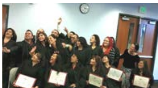
Community Leadership Programs