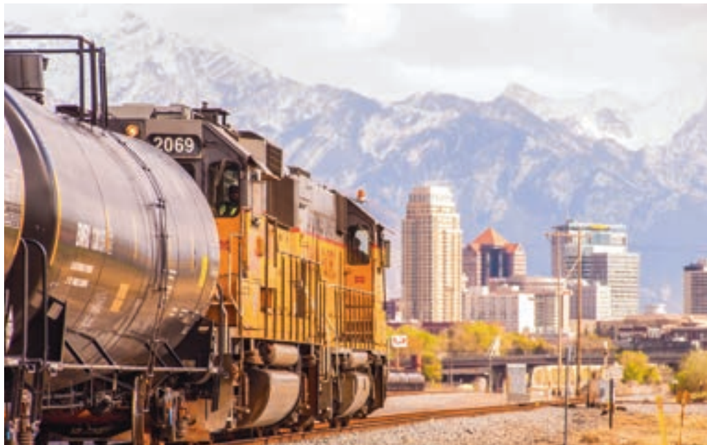
One of the defining features of the west side of Salt Lake City is the network of railroad tracks – miles and miles of steel snaking across the valley floor. The railroad united our country, but divided our city into “right” and “wrong” sides of the tracks.