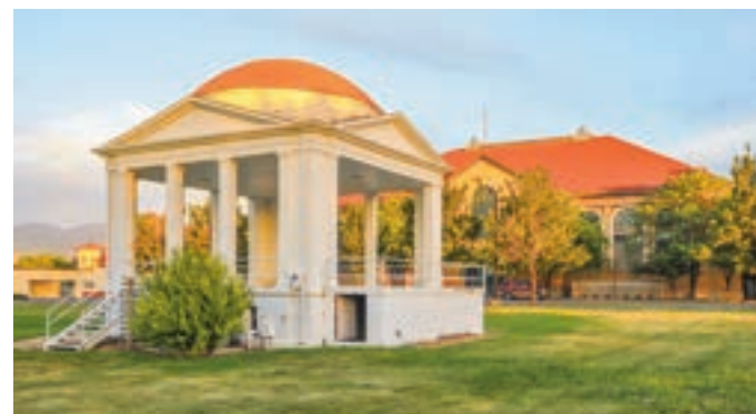
The Gazebo glows in the setting sun.