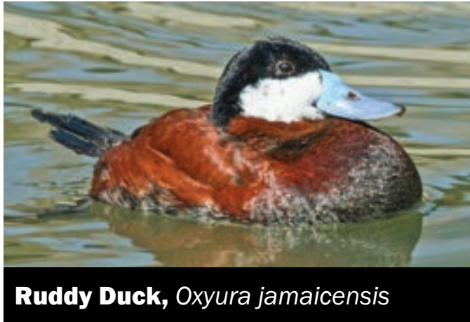
Ruddy Duck, Oxyura jamaicensis

The first time I saw a ruddy, I was jump shooting ducks. I jumped up close to a cute little male with its tail held high expecting it to either jump off the water like similar sized green-winged teal, or at least run across the surface to fly away like American coot. Instead, to my surprise, it dove under the water only to reappear out of