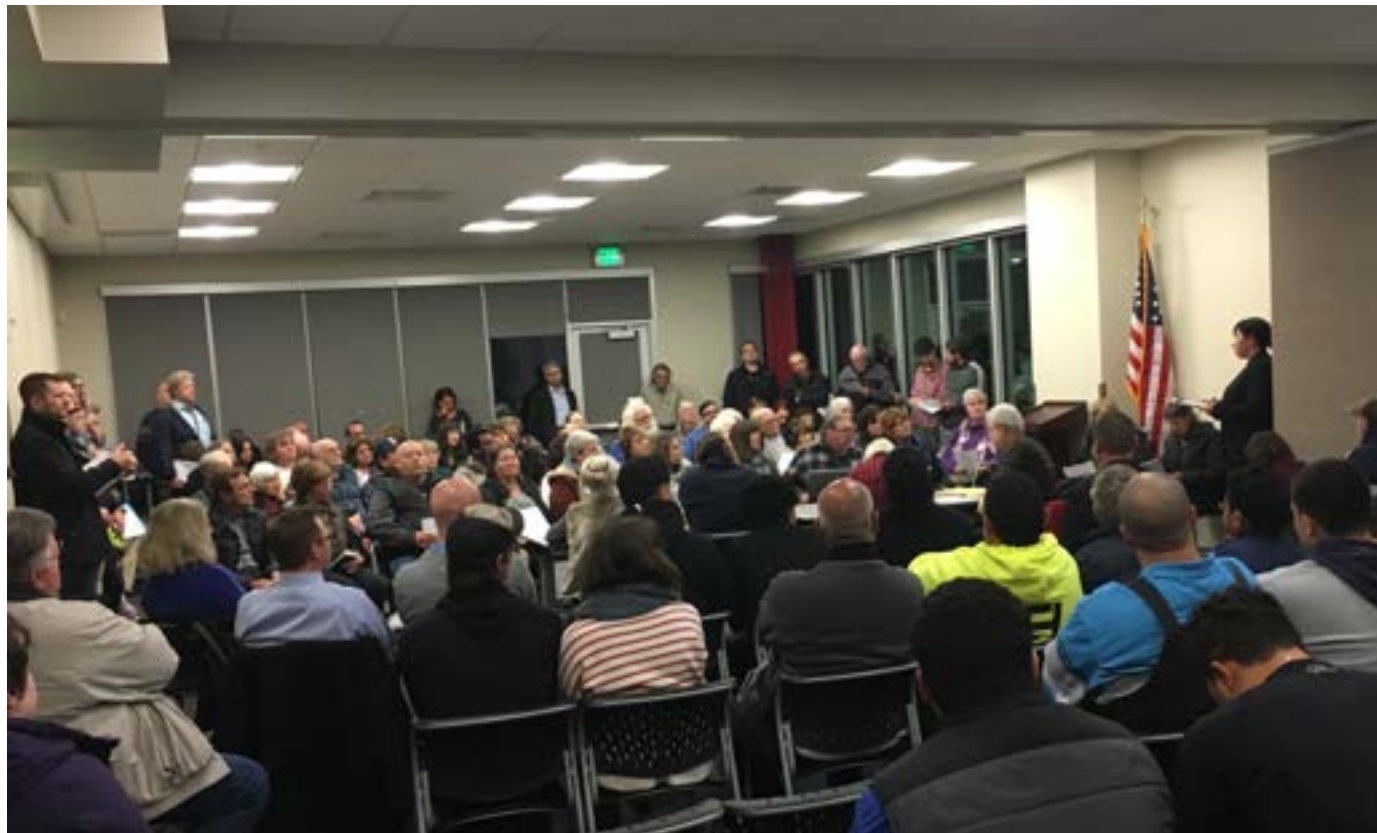
Over 100 concerned residents packed the Glendale Library meeting room at the January Glendale Community Council meeting.